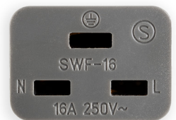
SWF-16 16A C19

Note! The connector must be connected to a wall socket with a ground terminal for the full LoRad effect to take place. Lorad are tested and certified by Intertek Sweden, meeting the European safety regulation HD21.5 S3.