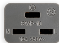
SWF-16 16A C19

Note! The connector must be connected to a wall socket with a ground terminal for the full LoRad effect to take place. Lorad are tested and certified by Intertek Sweden, meeting the European safety regulation HD21.5 S3.